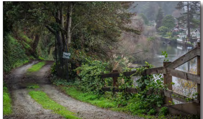
Group AAA - 1st Place Overall - Photographer's Choice - Carmay Knowles