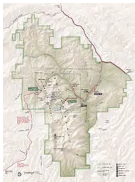
Pinnacles National Park

"Visitors during this holiday weekend are seeing shooting stars (Dodecatheon clevelandii ssp. patulum) out on the trails in the park. These members of the primrose (Primulacea) family are a colorful gift from the early December rains this winter."