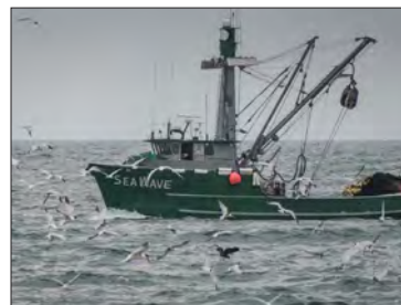
Moss Landing - Carmay Knowles

To learn about some of our past Group Shoots, Field Trips and other outings, please see the "In The Field" link at our website.