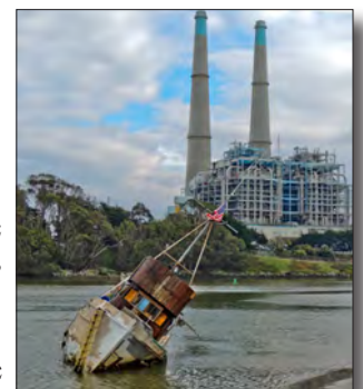
Moss Landing - Ken Jones

Members are encouraged to send in up to ten of the images they deem the best of the lot. These are presented to the membership at a future general meeting. It's always motivating to see how twenty or so different sets of eyes see and capture the same general area.